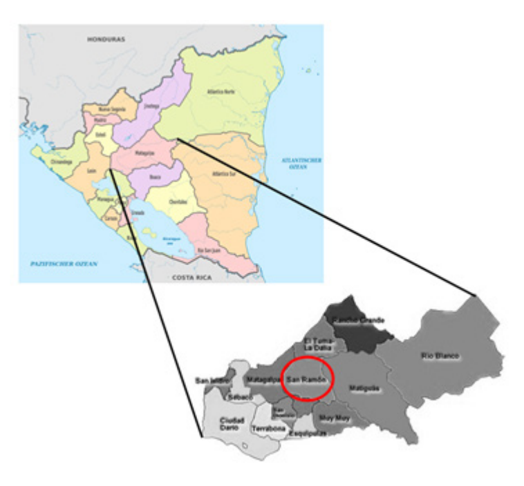
Figure 1. Zone in study

The universe of study was 5 653 households, located in the urban and rural area of the municipality of San Ramón. The urban area is divided into 9 neighborhoods and the rural area formed by 11 towns with 51 communities.