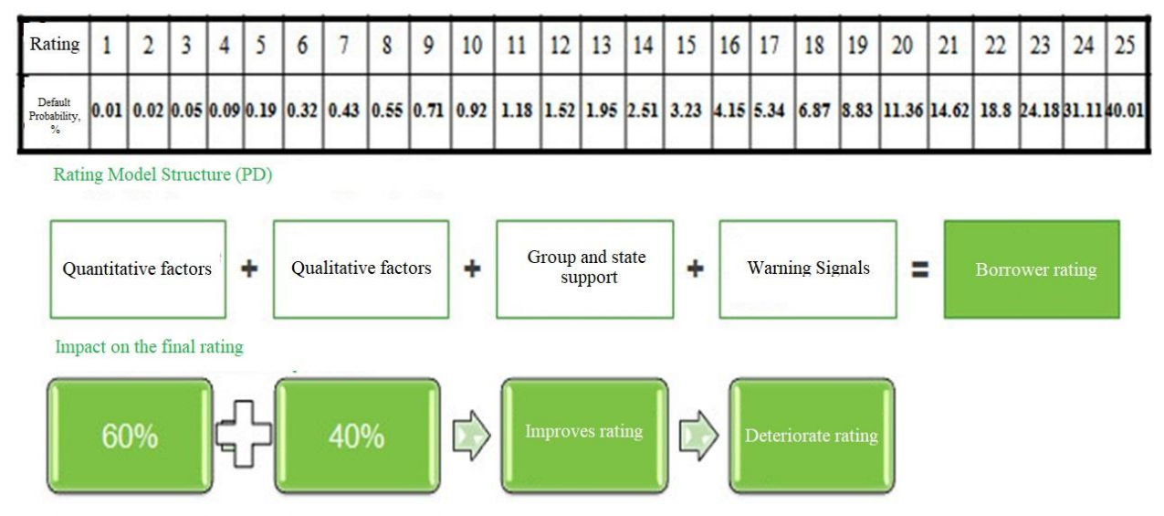
Figure 3. Structure of the rating model (PD)

The PD model shows with what probability the borrower can fall into default, i.e. allow a delay on obligations of 90 days, within the next year (Figure 3).